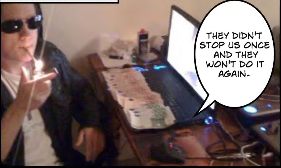
MEANWHILE AT GHOSTMARKET HQ...

THEY DIDN'T STOP US ONCE AND THEY WON'T DO IT AGAIN.